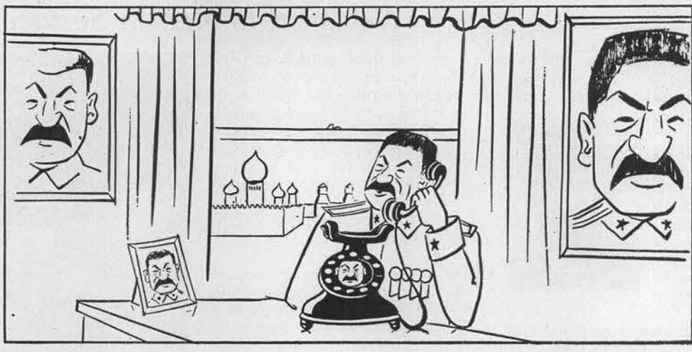
No, this is NOT 6-4411.